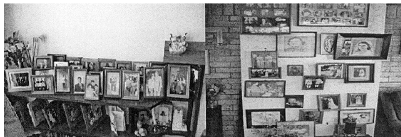
Figure 2: Photograph displays [Interviewed by Participant R]

Digital photos are easier to share, and offer increased opportunities for sharing. Photos displayed as wallpaper or in screensavers on home PCs are easier to update than framed photos on walls. Participants reported organizing slide shows of photos from recent activities ("I have a photo viewing session in my room, using my monitor, after every night out with the camera for my flatmates"; Participant M); sharing of photos from an event can itself become an event, which can also be photographed for later viewing! Participant M reports that "it's always great looking through the photos of the night before and comparing what we remember (or don't remember) to the photo." Photos are emailed, sent as PXT messages, viewed on the LCD screen of the digital camera immediately after they are shot, transported on memory sticks, burned to CDROM...the list expands with each new device and display opportunity.