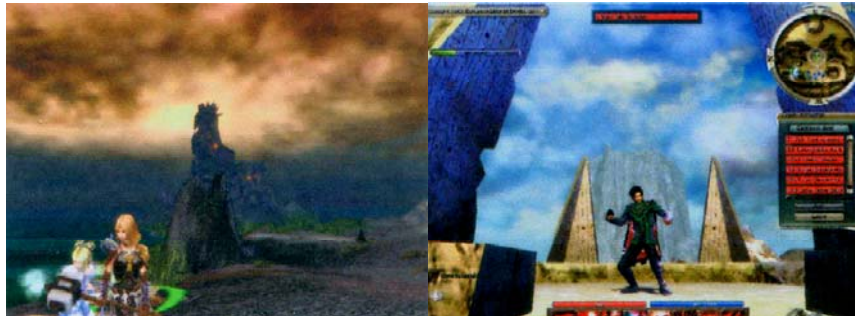
Figure 5: Photos Taken within Guild Wars, ‘as a tourist’ at Perdition Rock and with the Participant ‘in an action photo’ at Augery Rock [Participant K]