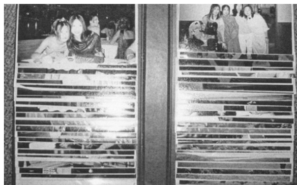
Figure 3: A temporary photo album [Participant N]

The events shared through photos need not even be real. 'Photoshopped' or staged photos can provide a humorous topic for conversation "and hopefully give them a laugh as well" [Participant M] (Figure 4). Online communities offer the opportunity for online experiences that are compelling enough to capture and share (Figure 5); the 'photos' can be shared within the game or other role-playing environment, and can also be shared in the 'real' world ("I even used both of the images as my desktop wallpapers"; Participant K).