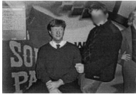
Figure 4: “Me and Bill Gates Sharing a Moment” [Participant M]