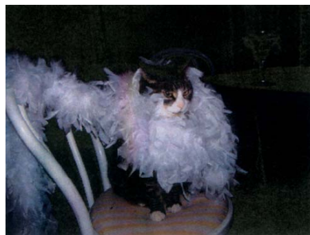
Figure 6: A humorous photo taken for the sole purpose of sharing [Interviewed by Participant L]

With digital cameras, on the other hand, people are much more likely to take a photo and after viewing it decide what they may wish to use it for; e.g., keep it, make it their desktop image, put it on the web, email it to someone else, etc. Photos can be taken for the sole purpose of sharing—a humorous situation or an odd image is captured and sent on (Figure 6). Similarly in some cases the type of the digital camera being used defines the intended use of the resulting photo. For instance many of our study participants have mentioned that they use their mobile phone cameras, which are low resolution, only for taking humorous photos which they primarily want to share with others rather than to keep for themselves; they use better quality digital cameras with higher resolutions for taking more "serious" photos which can be kept and/or shared with others.